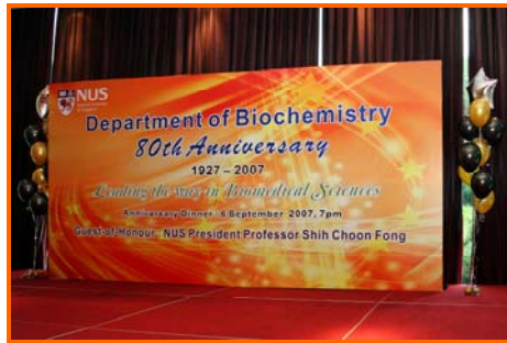
Biochemistry's 80 th Anniversary Dinner.