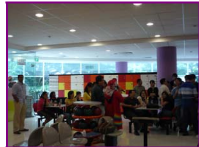
Giving away the prizes.