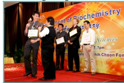
Biochemistry's Handsome and Charming Gentlemen..