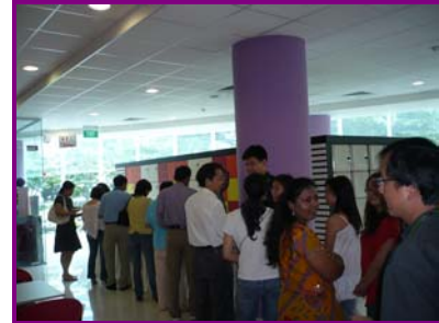
The long queue for the food...