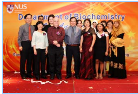
The Organizing Committee.