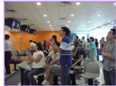
Cheering for the team.