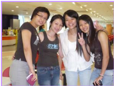
Pose for the camera!