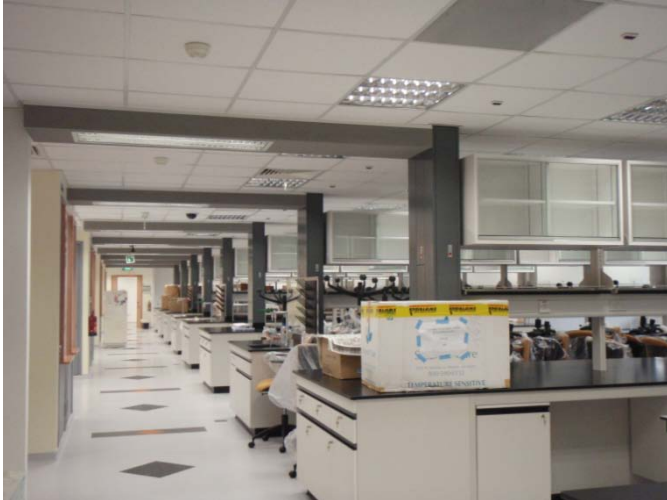
The newly renovated open lab on Level 3.