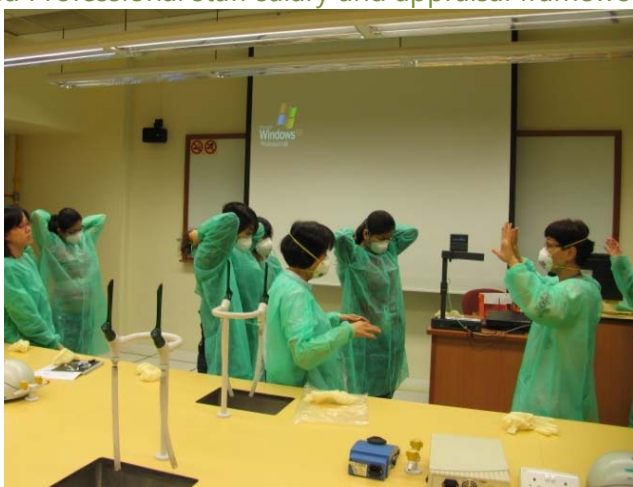
Emergency Awareness Session