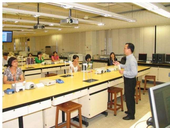
Career Path Ahead...