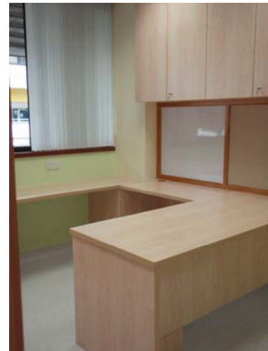
New staff office at Level 3.