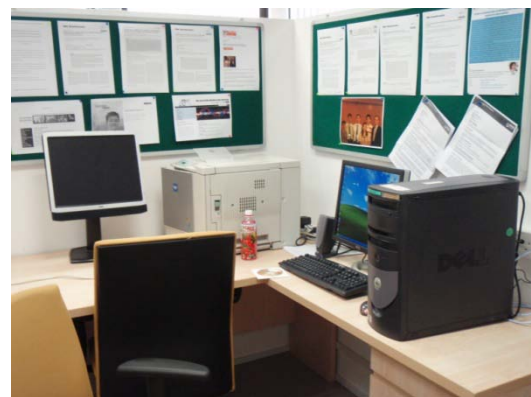
The Bioinformatics staff office.