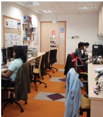
The Bioinformatics lab staff work stations.